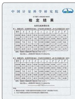
calibration certificate (included)